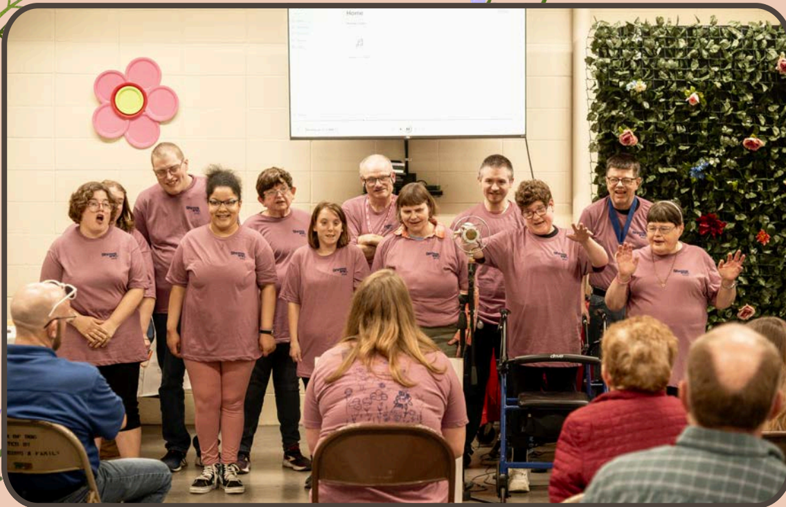
THE RUSHVILLE SHARES SHOWCASE CHOIR SINGS FOR THE PROGRAM