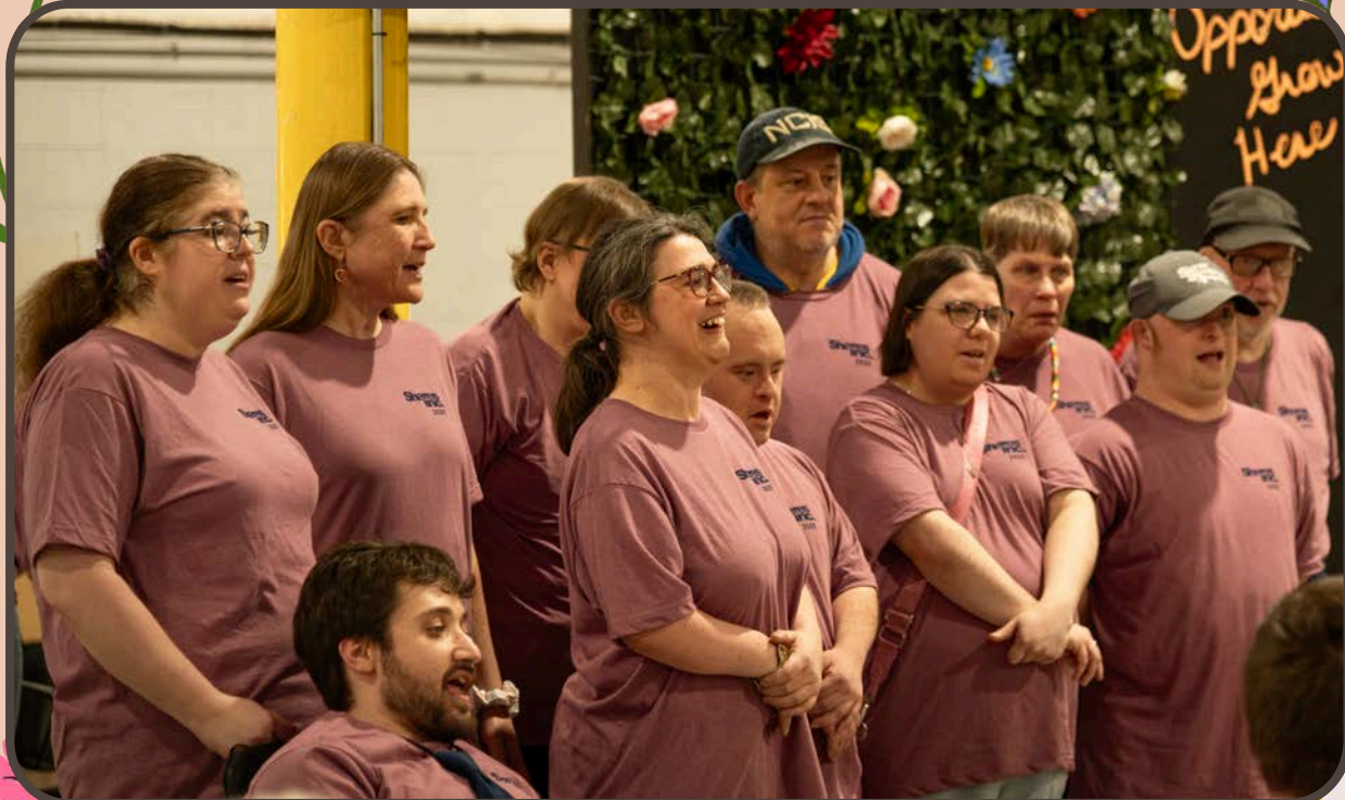
THE GREENFIELD SHARES SHOWCASE CHOIR SINGS FOR THE PROGRAM