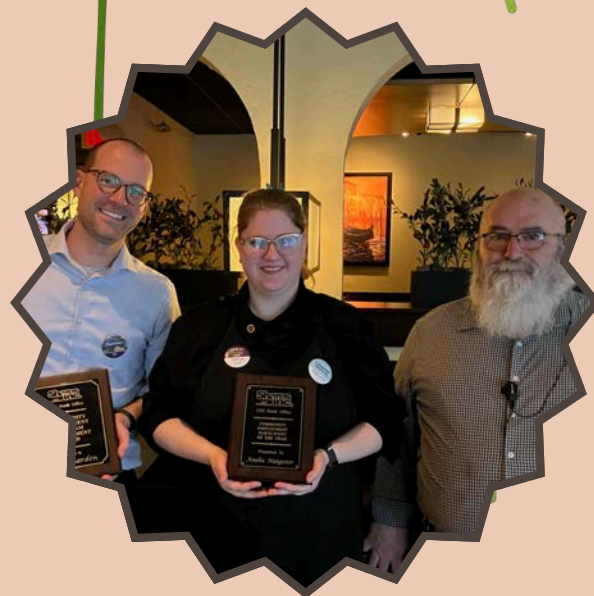
COMMUNITY EMPLOYMENT DEVELOPMENT AWARD: OLIVE GARDEN