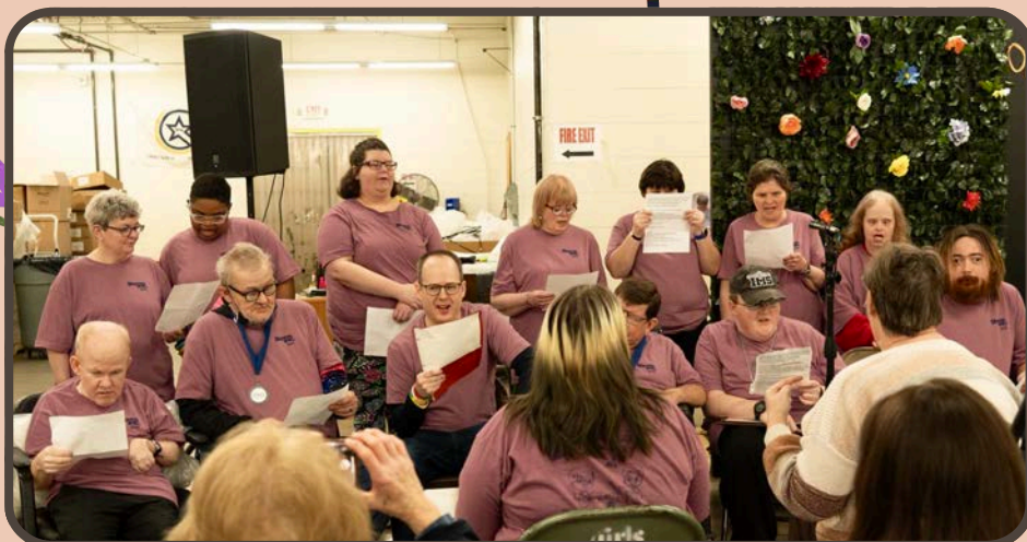
THE SHELBYVILLE SHARES SHOWCASE CHOIR SINGS FOR THE PROGRAM